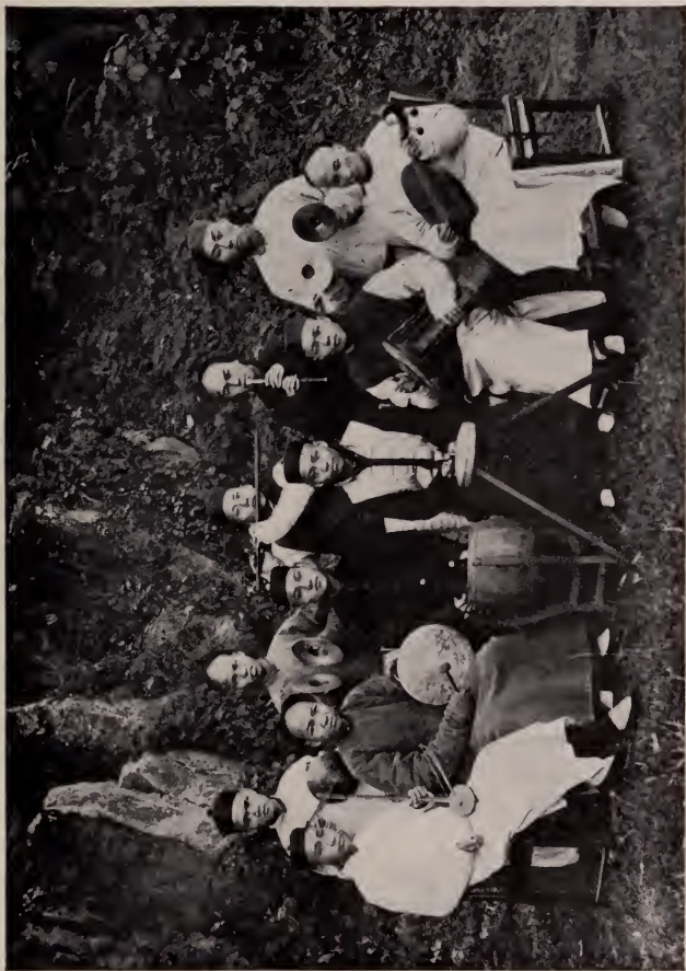
A COLLEGE ORCHESTRA IN CHINA.